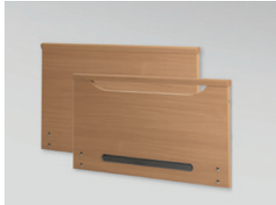
Wooden head and footboards: Primus headboard closed/ footboard with handle bar, with or without integrated linen holder