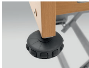
Wall deflection roller with holder