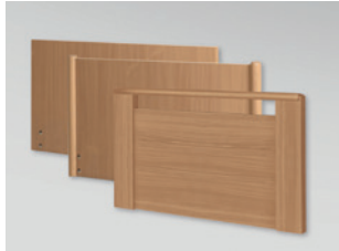
Wooden head and footboards: Standard (as standard), Comodo with round posts (optional), Prinzino with handle bar (optional)