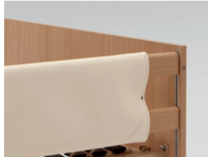
Foam leather cover