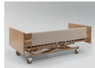
Foam leather cover