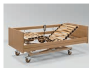
Manually adjustable lower leg rest