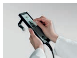
Handset with selective locking function