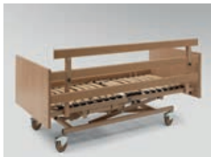
Clamp-on extra-high safety side rail