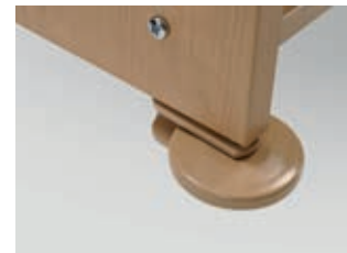
Wall deflection roller with holder