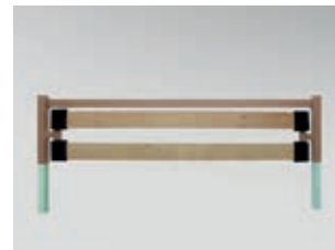
Bed extension, including extra-high safety side rails (also for retrofitting)