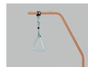
Patient lifting pole