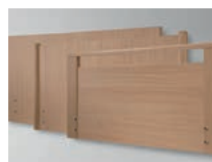
Various wooden headboards and footboards available: "Standard" without round posts, "Comodo" with round posts, "Prinzino" with grip rail