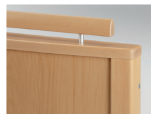
Solid wood grip rail (not for retrofitting)