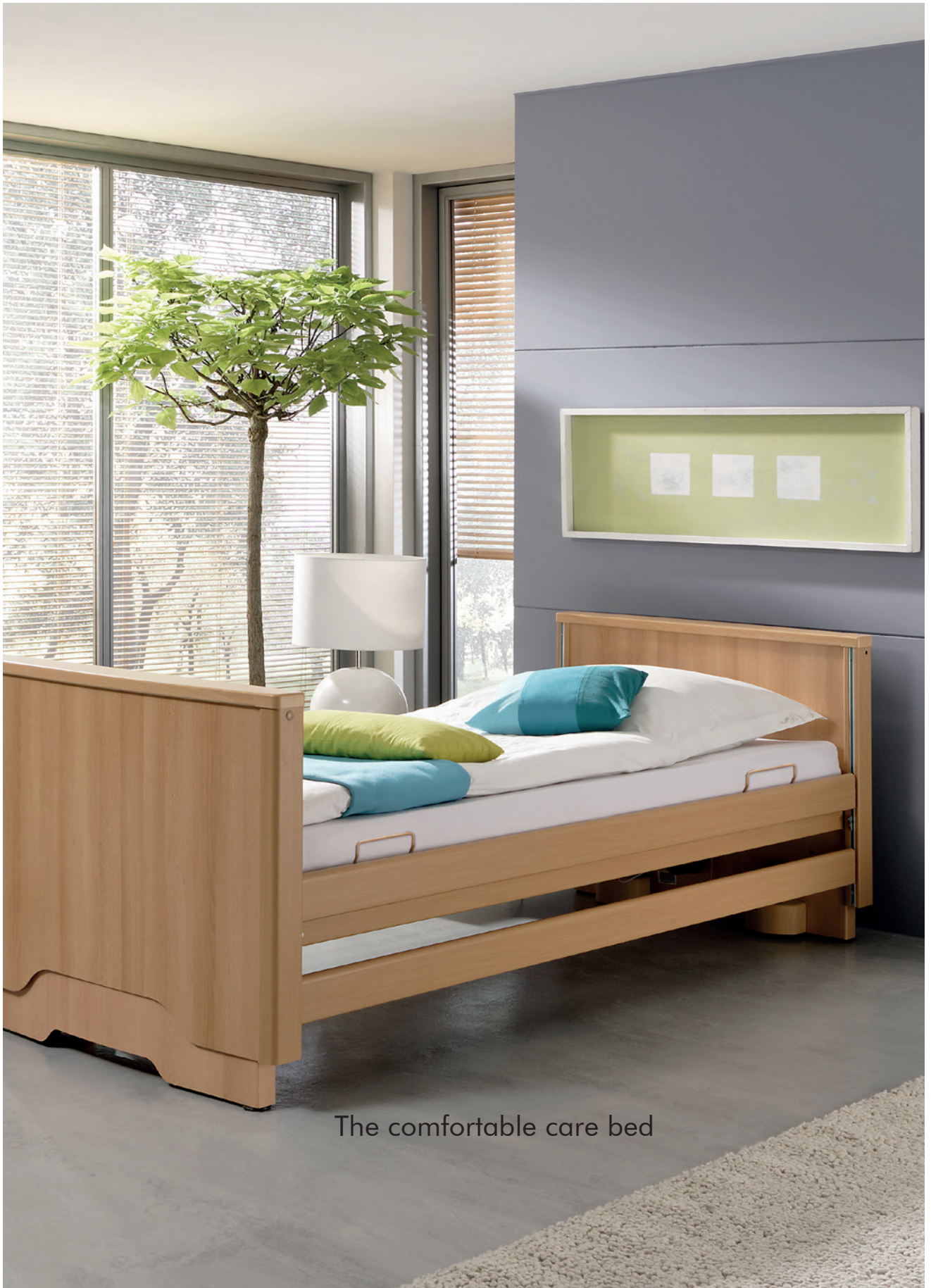
The comfortable care bed