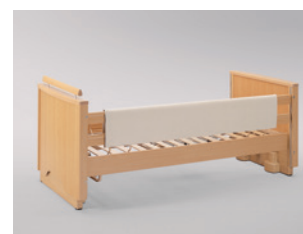
Foam leather cover for safety sides