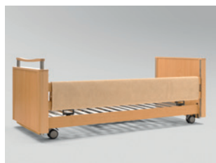
Foam leather cover for safety sides