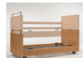
Mattress base adjustable from 22 - 77 cm, adjustment range = 55 cm