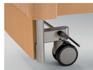
Castors can be locked in pairs in every mattress base position