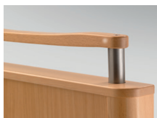
Solid wood grip rail