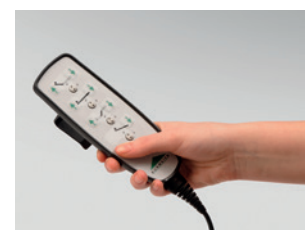
Handset with selective locking