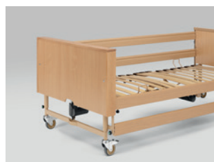
Wooden panels for the chassis (also for retrofitting)