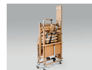
Compact delivery and storage on storage aid/transportation aid