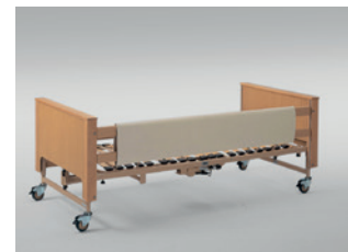
Foam leather cover