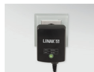
Electronic switch mode power supply unit integrated immediately after the mains plug