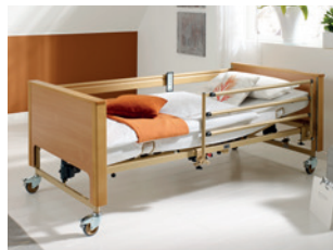
Adaptable safety sides