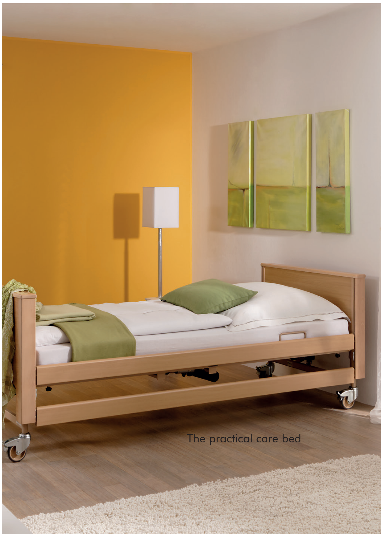
The practical care bed