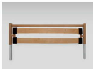
Bed extension including extra-high safety side rails (also for retrofitting)