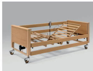
Mattress base with metal supporting bars