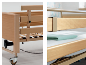
Left: clip-on extra-high safety side rail Right: turnable handrail