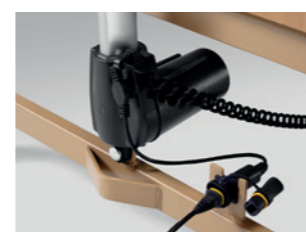
Power socket for connecting the electronic switch mode power supply unit