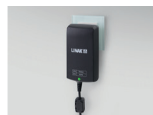
Electronic switch mode power supply unit integrated immediately after the mains plug