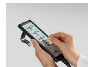
Handset with selective locking device