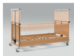
Adjustment range from 30 - 80 cm