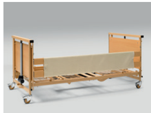
Tray for Allura II and Allura II 100