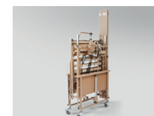
Compact delivery and storage on storage aid/ transportation aid (similar to illustration)